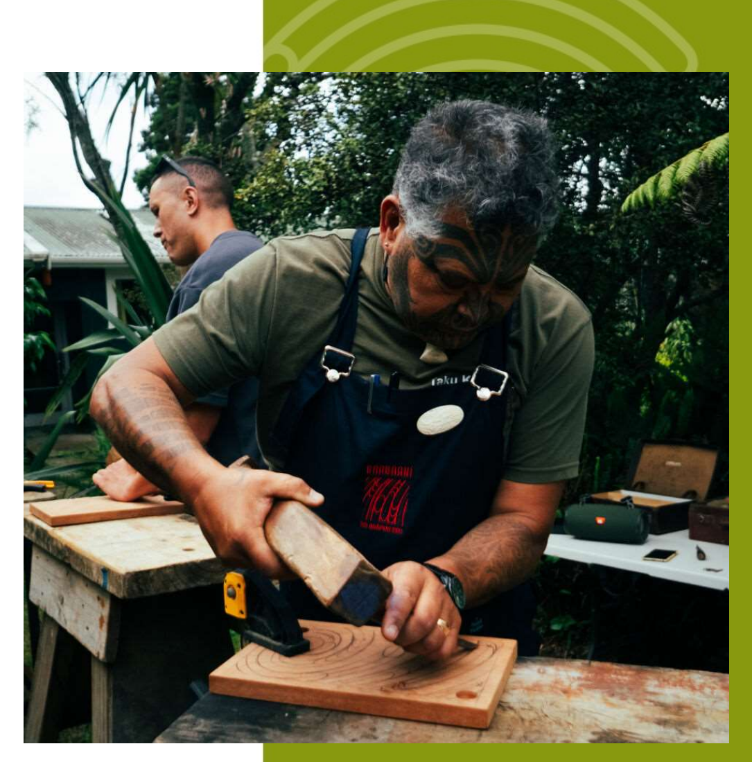
Toi Ngā Puhi Unaunahi Wānanga, Ngawha, 2022