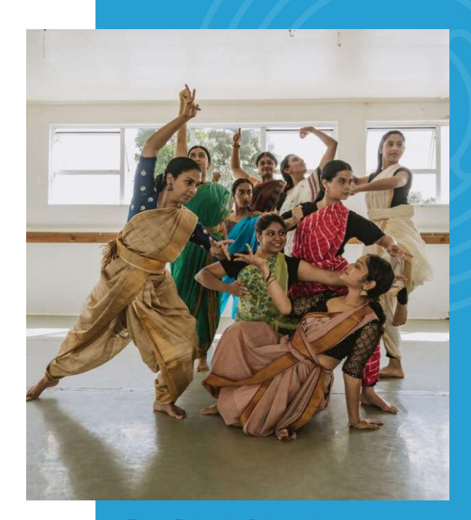
Fierce Fairytales Rehearsal Photograph: Aaja Nachle