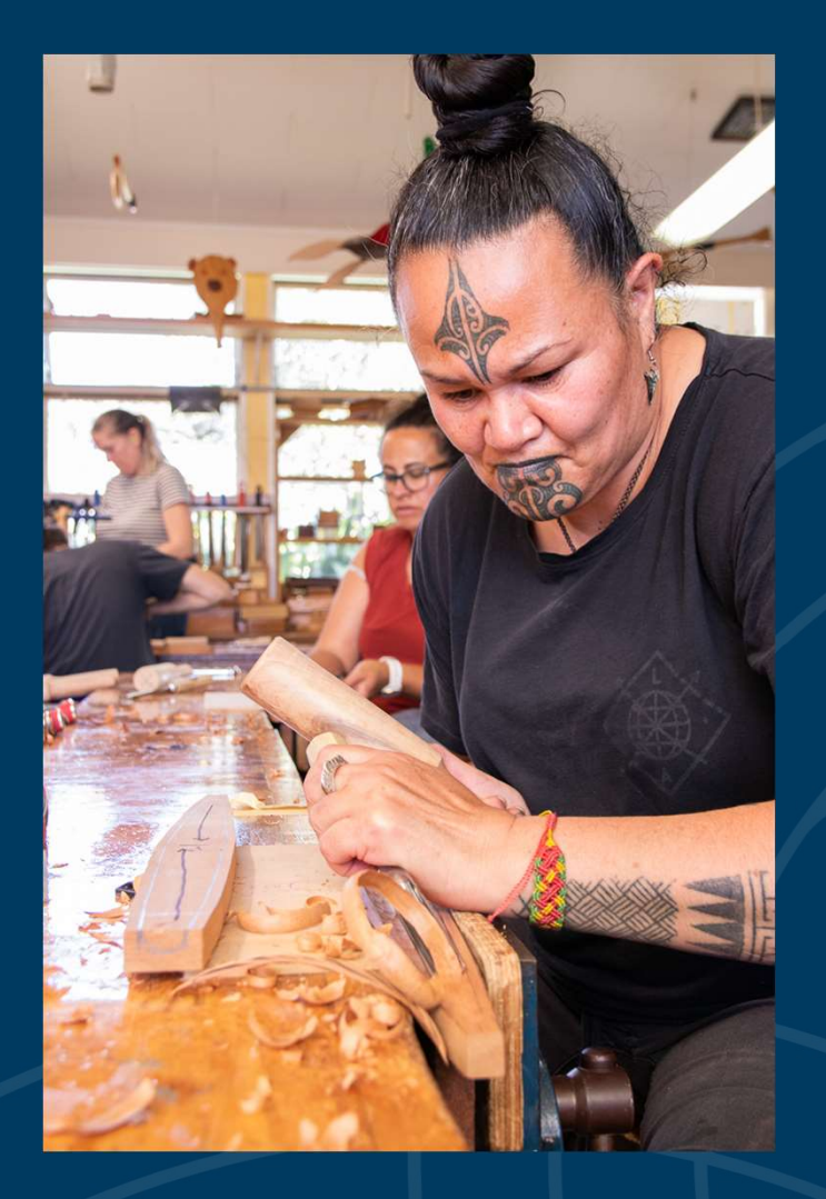
Pōneke Taonga Pūoro Making Wānanga, Wellington City Council, 2021 Porotiti Rangitaawa

Visit your council's website for more information.